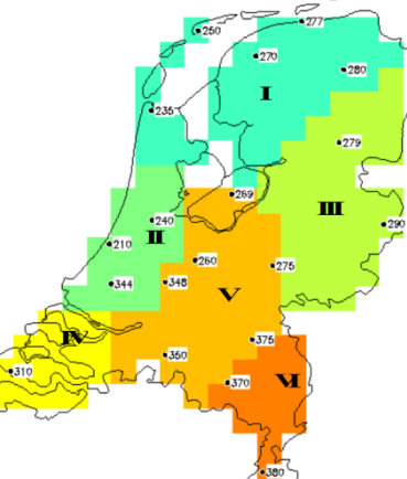
Figure 1. OPS meteorological districts and locations of KNMI stations.

Primary meteorological data measured at 19 sites by the Royal Netherlands Meteorological Institute (KNMI) are provided to the model, being wind speed, wind direction, global radiation, temperature, relative humidity, precipitation duration and intensity. First, these are spatially interpolated over the Netherlands to a 10 km by 10 km grid using a weighting factor depending on the distance between the station and the grid point. In order to make the system less vulnerable to missing data from one station, district / regional averages are calculated (Figure 1). The primary meteorological data are used to determine a.o. the Obukhov length, friction velocity and sensible heat flux, which are used to determine the boundary layer height. These also serve as input to determine the amount of turbulence from which the dispersion lengths are calculated.